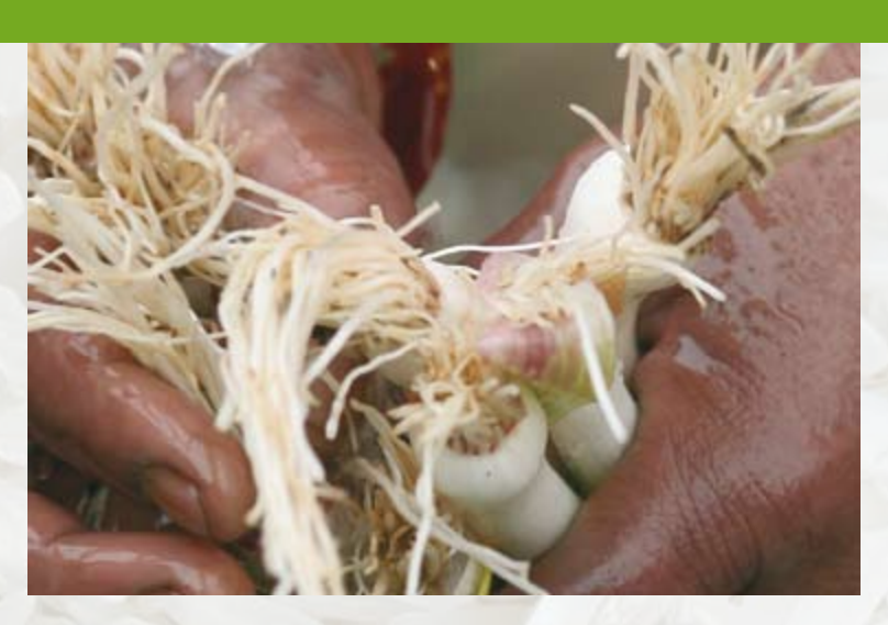
LWF ELEVENTH ASSEMBLY STUDY MATERIALS